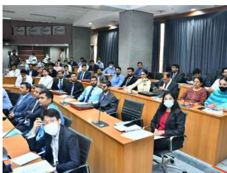
Participants of MBA (Finance) 2022-24 Batch attending 4th Edition of PICUP Fintech Conference & Awards at FICCI, New Delhi