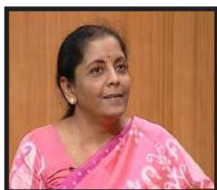
Smt. Nirmala Sitharaman

Union Minister of Finance and Corporate Affairs