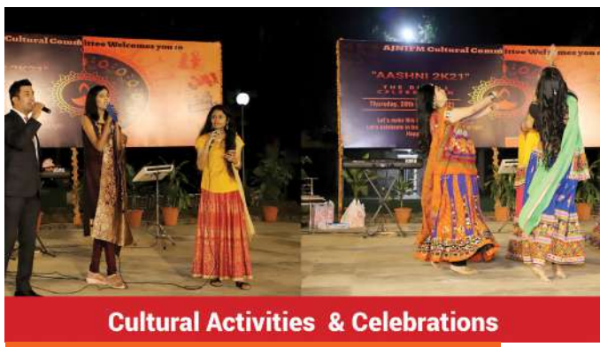
Cultural Activities & Celebrations