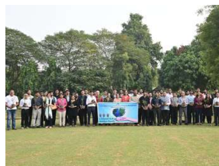
One Tree One Student, activity held at AJNIFM, all participants of MBA Finance (2023-2025) planted