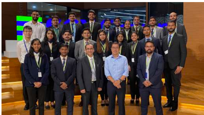
Participants of MBA (Finance) 21-23 at Singapore Stock Exchange, Singapore in October 2022 during International visit