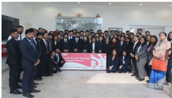
Participants of MBA (Finance) 2022-24 & 2023-25 batch visited Yakult Plant Sonapat Haryana under Industrial Visit of Programme