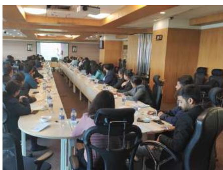
Participants of PGDM (Finance) 2020-22 and 2021-23 Batch at SEBI during domestic visit to Mumbai