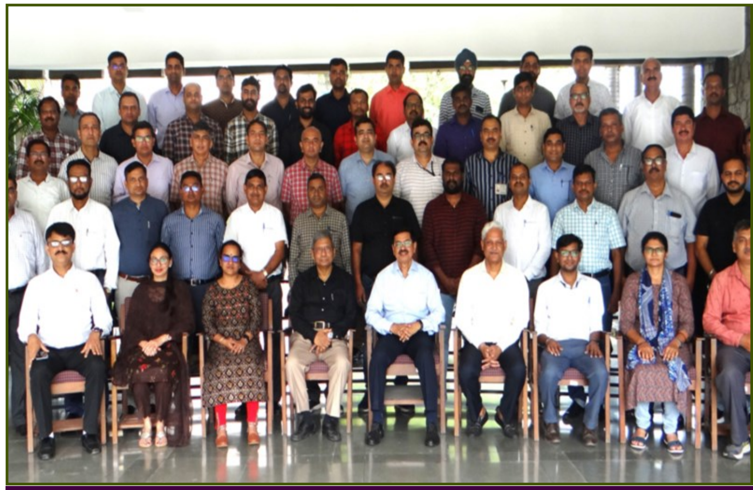
Azadi Ka Amrit Mahotsav