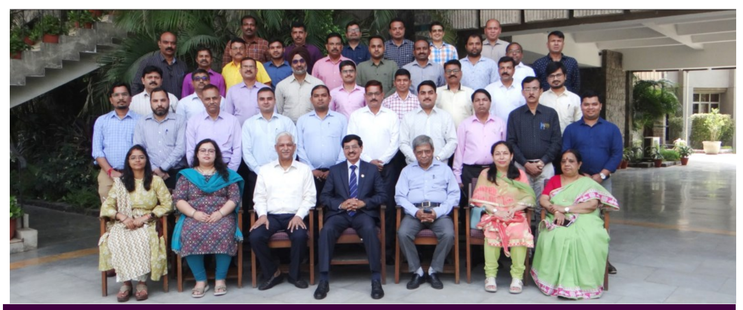
Group Photo of Program on Public Procurement (Basic)

MDP on Concepts of Accounting in Relations to Goods & Services Tax (GST) for the Officers from Himachal Pradesh Kuashal Vikas Nigam (HPKVN) was held where 36 officers participated.