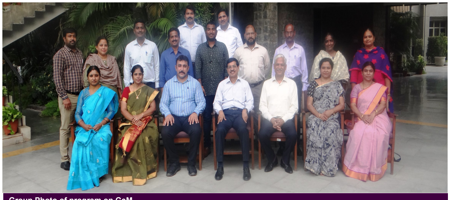
Group Photo of program on GeM